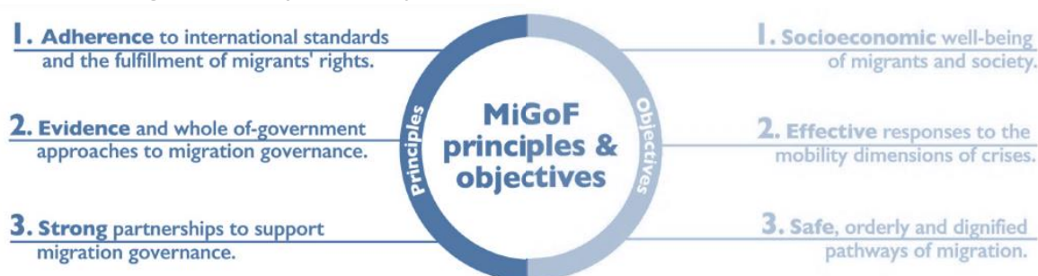
Figure 1. Principles and objectives of the Migration Governance Framework

The three principles propose the necessary conditions for migration to be well-managed by creating a more effective environment for maximized results for migration to be beneficial to all. These represent the means through which a State can ensure that the systemic requirements for good migration governance are in place.